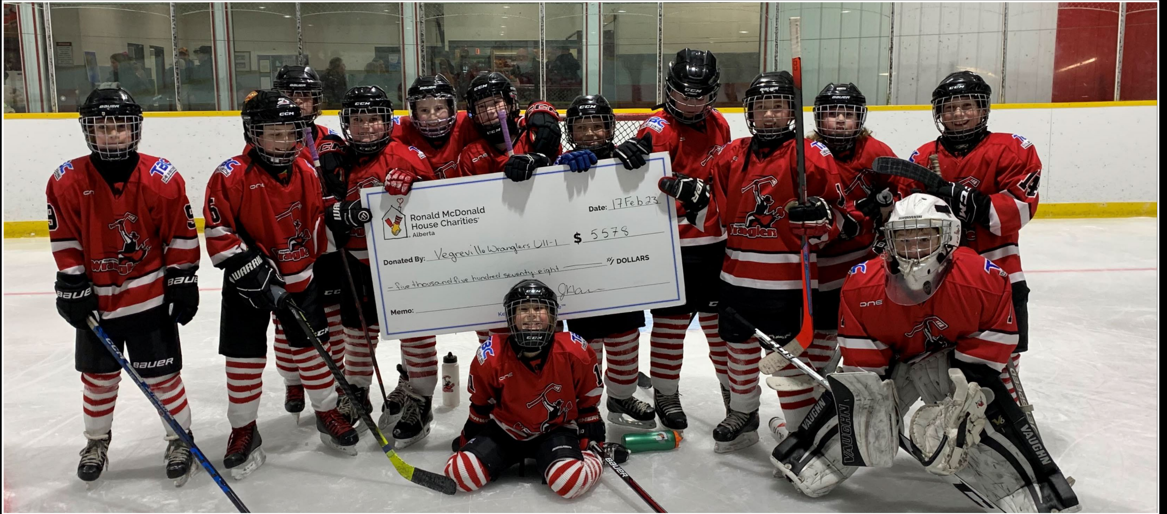
Team Challenge Winner- Vegreville U11 Wranglers