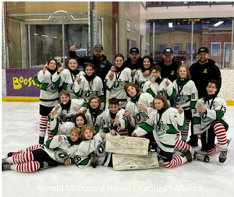
Ronald McDonald House Charities® Alberta