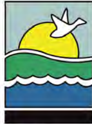
Town of Bonnyville "It's Multi-Natural"